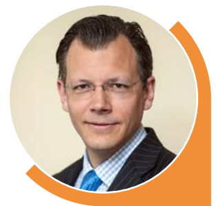
Ulrich Bindseil Director General, Market Infrastructure and Payments European Central Bank